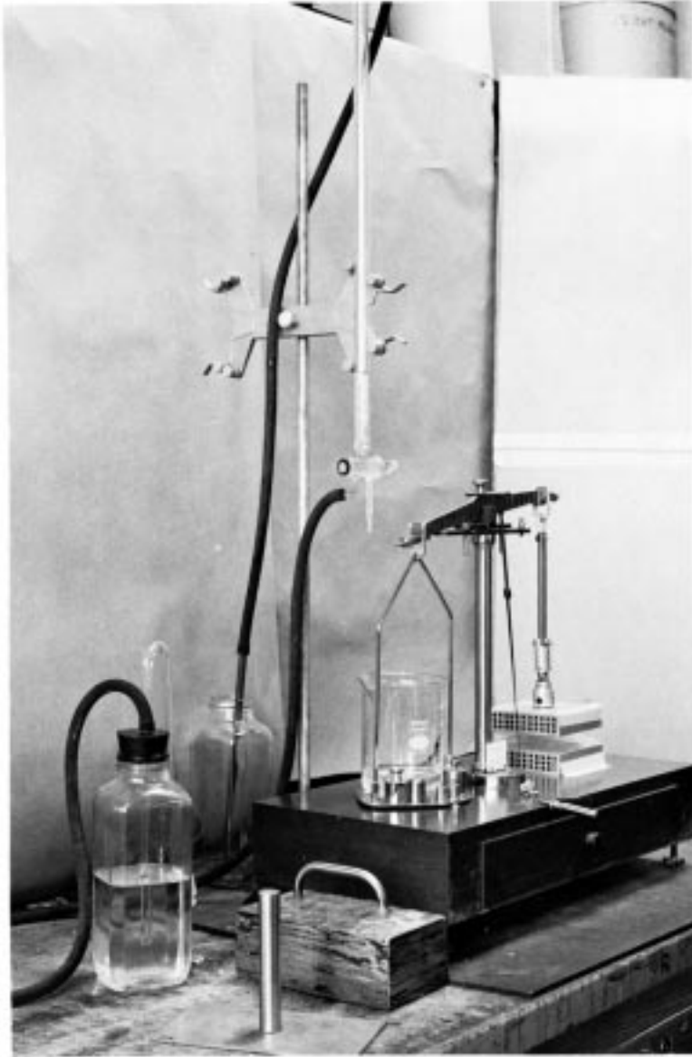
FIG. 1 Balance Modification with Buret Assembly

6.2.2 A typical stationary aluminum block is 100 \pm 1 mm (4 by 4 in.) and 20 \pm 0.1 mm thick. If holes are drilled through the blocks for mounting they must be countersunk so that the head of the fastener is below the surface of the block. Back-mounting tapped holes are preferred to leave a smooth surface.