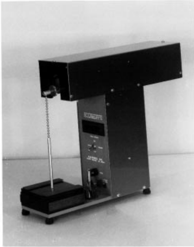
FIG. 2 Electro-Mechanical Device

the film. Five specimens shall be tested. If the test specimens are taken from a roll, care should be taken that the roll is in good condition. The specimens should be taken at least 25 mm below the outer surface of film rolls.